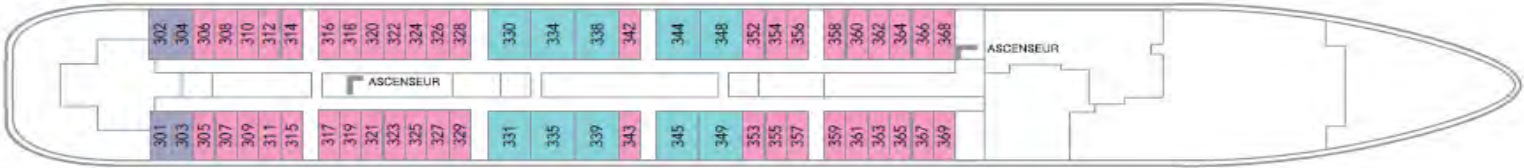
PONT D DÉSIRADE